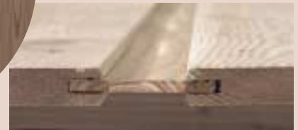
Double grooved, vertical