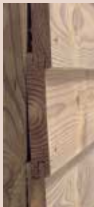
Double grooved, horizontal