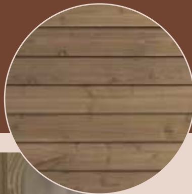
Mitered lapped planking, horizontal