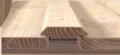
„Bergische Schalung“, vertical board and batten